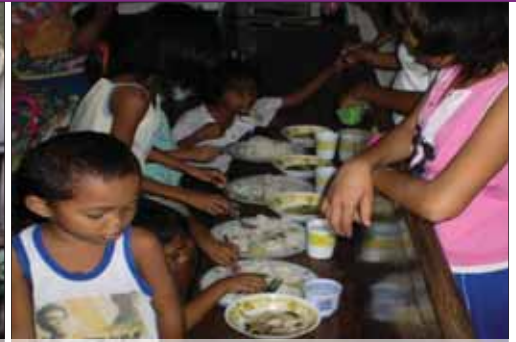
FGG provided funds for a one-year children's feeding program.